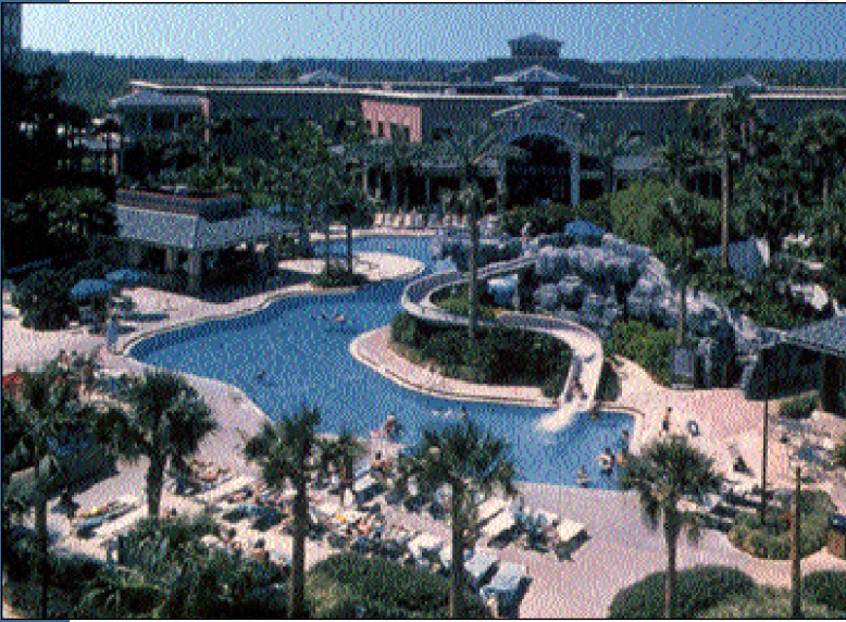
Waterslide at the Caribe Royale Resort